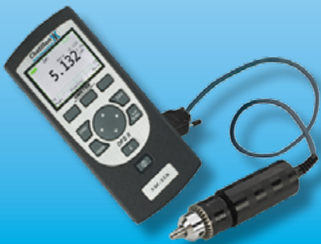
STS Sensor attached to the DFS II-R-ND gauge for torque measurement.