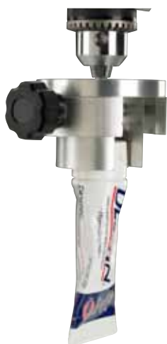
STS sensor attached to the B200308 torque fixture for measuring cap torque strength.